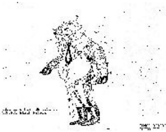
Click for full size picture. (8K)